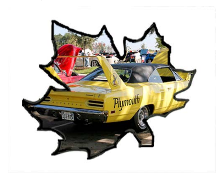
October 20, 2007 Georgetown, TX