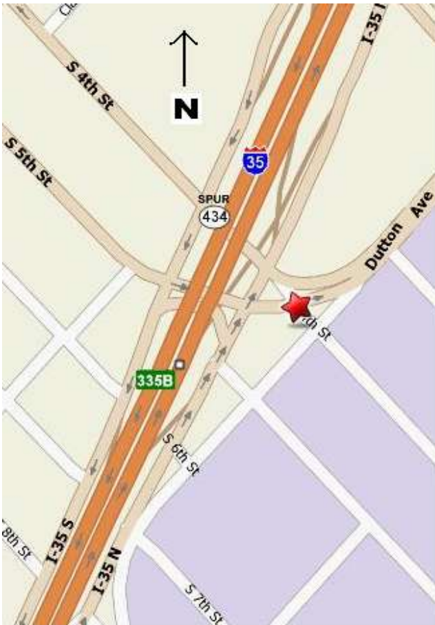
Exit 335, the 4th+5th St Exit. The hotel is next door to IHOP.