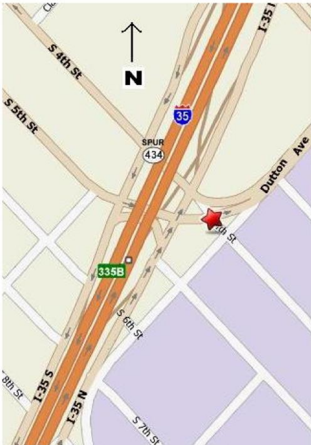
Exit 335, the 4th+5th St Exit. The hotel is next door to IHOP.

Exhaust: Open ____ Closed XX Speed Events: Hi ____ Low XX