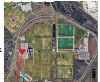
Meet us at Parking Lot A

Three Concurrent Rallyes will start from Northeast Metropolitan Park (NE METRO PARK) in Lot A (15500 Sun Light Near Way, Pflugerville, TX 78660) and end at Asada's Grill (501 W Canyon Ridge Dr, Austin, TX 78753). The rallyes will be Time-Speed-Distance; Gimmick; and, Chance. Prizes for the rallyes will be based on total points earned by the teams not individual rallyes. Top 3 teams will win prizes. An NCCC Car Show (People's Choice) will be held after the rallyes at Asada's Grill. The Top 3 Cars with the most votes overall will win prizes. It is required that all rallye teams comprise of a driver and a navigator. The car show does not require two people. Non-NCCC member participants will only earn points for prizes and not effect the points chase by NCCC members. All rallye drivers will need to provide proof of liability insurance; current vehicle registration; and, a valid driver's license. All cars will need to pass a tech inspection before being allowed on the rallye course. Car show only participants: You can trailer cars but we must see the vehicle move under its own power.