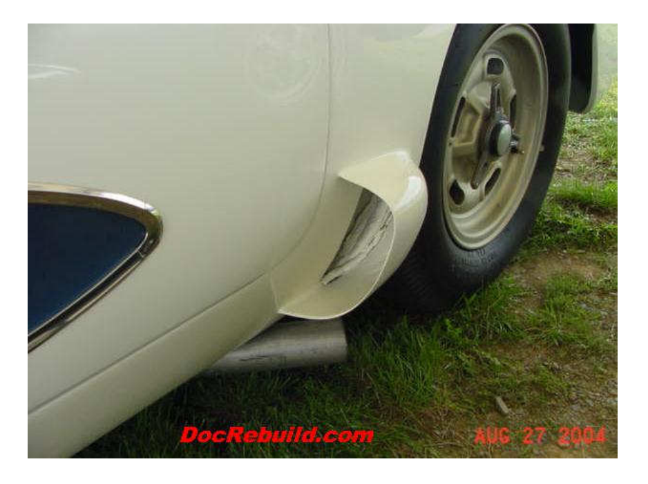
Note the exhaust pipe dump in front of the rear wheels and the scoop for brake cooling.