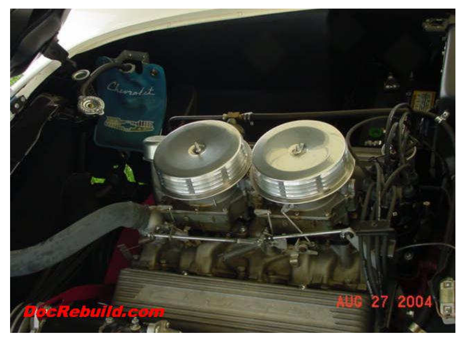
Note the typical dual quad air cleaners and washer bag - that is being used as a radiator recovery tank.