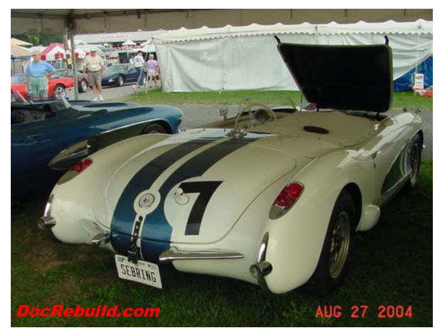
Note the tonneau cover over the passengers seat.