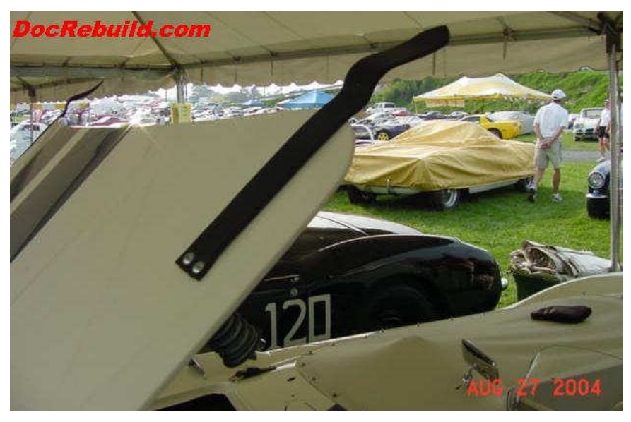
Black leather belts for extra hood security on the hood.