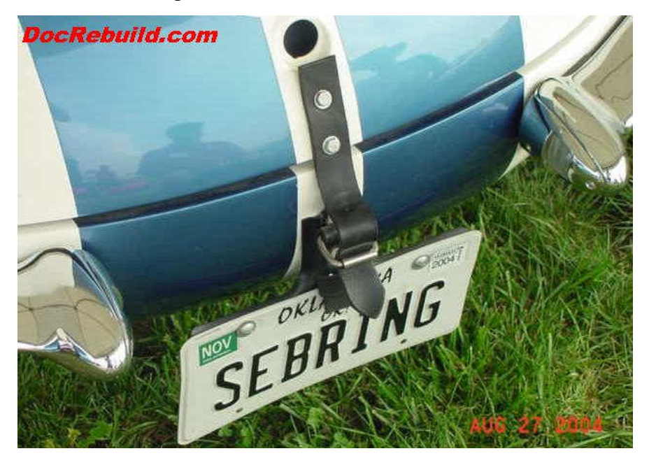
No need for a trunk lock cylinder with the leather hold down strap.