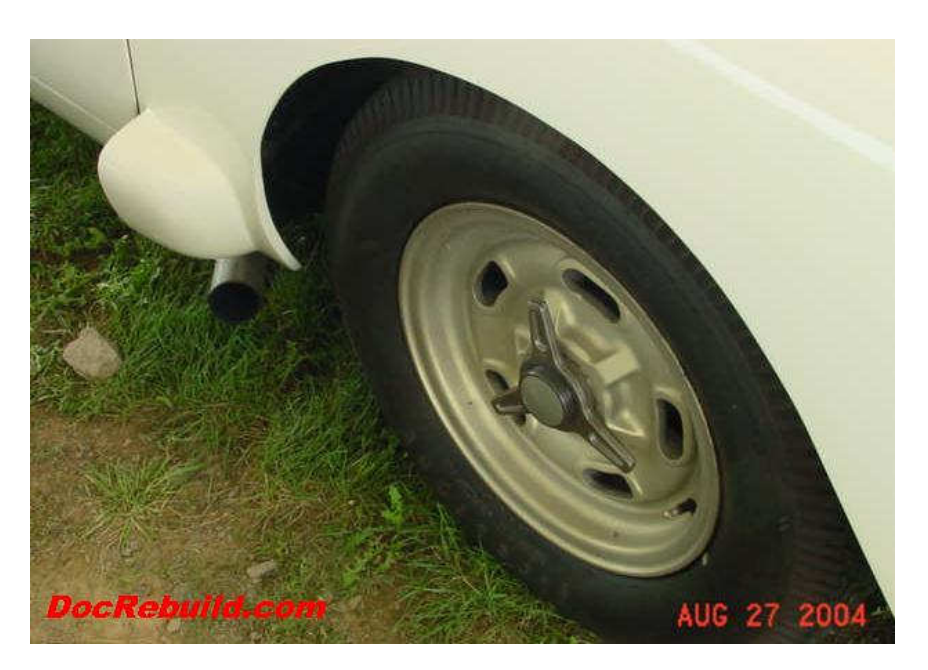
Another view of the exhaust, scoop and the Halibrand KO's.