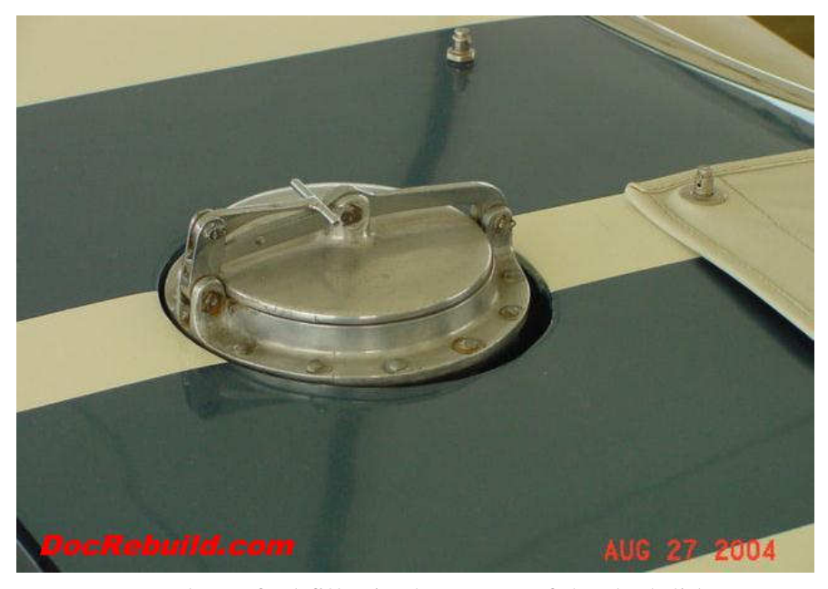
Note large fuel filler in the center of the deck lid.