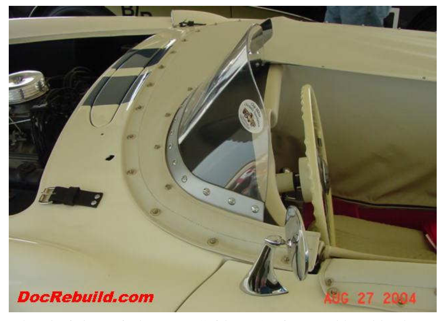
Note the plexiglass wind screen, Guide Y50 mirror and hood leather strap.